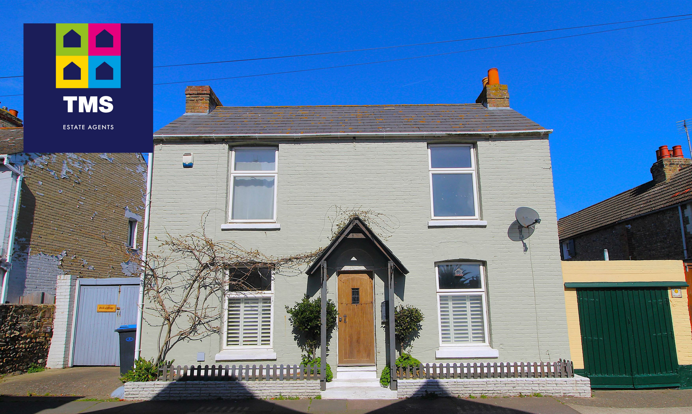
Weigall Place, Ramsgate. Guide Price £260,000